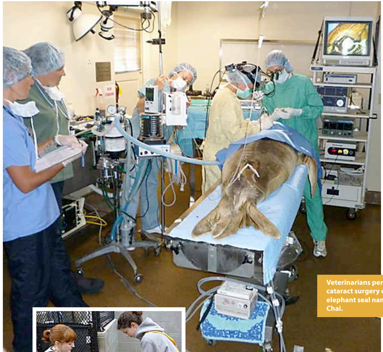
Veterinarians perform cataract surgery on an elephant seal named Chai.