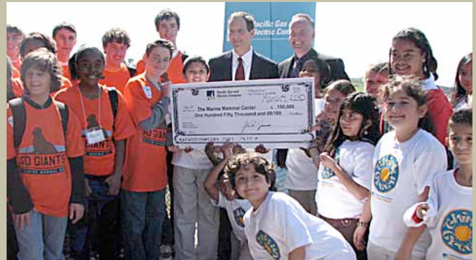
The Center was welcomed into PG&E's Solar Schools Program. On March 7, 2010, students from Willow Creek Academy (school participant) and Oakland Tech learned about solar power and marine mammals!