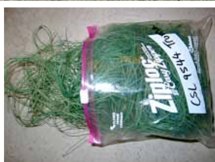
Left: This California sea lion patient named Sami Monkey was rescued with a thick entanglement around his neck. Right: This multifilament netting was removed from another sea lion patient named Tromar.

Abagnale's injury, sadly, is a common one at the Center. In 2010, approximately five percent of the 998 marine mammals rescued were stranded as a result of entanglement in, or injuries caused by, ocean trash and other human generated hazards.