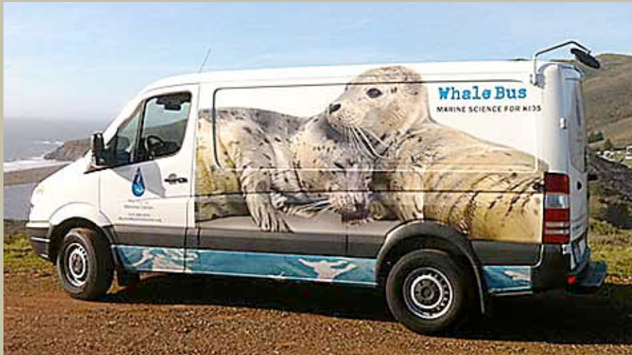
The Center's new Whale Bus vehicle and "wrap" were made possible by generous grants from the DMARLOU Foundation.

In 2010, the members of the Center's annual Corporate Partners Program ( http://bit.ly/f0JBN4 ) contributed more than $600,000; a remarkable achievement in a depressed economy. The top 2010 corporate partner contributors, Dawn (Procter & Gamble) and PG&E, deserve special recognition for their generous support.